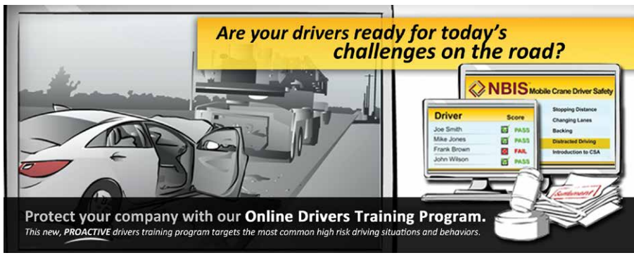
The curriculum for NBIS' Online Driver Training Program was developed after understanding the most notorious transportation accident-causation factors.

is the Specialized Transportation Program Manager for NBIS.